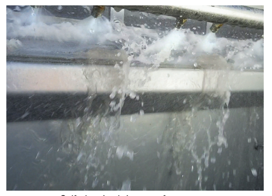
Self-cleaning brine transfer screens