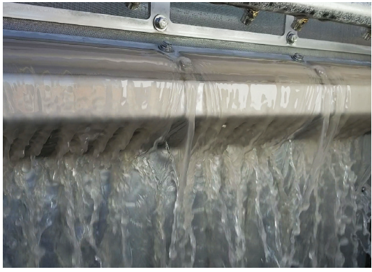
Screens filter brine