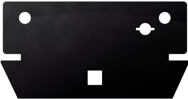
HTE239 17.50" x 33.13" overall 3/4" thick steel - For single axle MINIMUM ORDER QUANTITY: 1