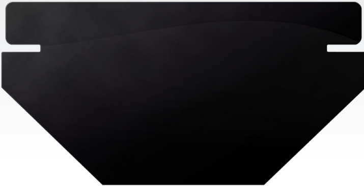
HTE45 17.09" x 33.13" overall 3/4" thick steel MINIMUM ORDER QUANTITY: 5