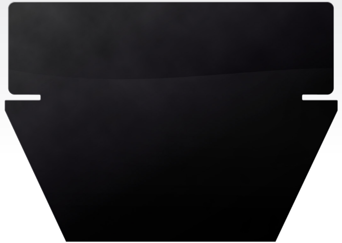
HTE208 24.50" x 33.13" overall 3/4" thick steel MUST ORDER IN GROUPS OF 7: 7, 14, 21 etc.