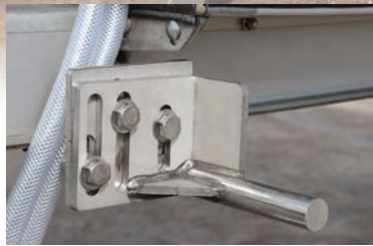
Adjustable trunnion latches are standard