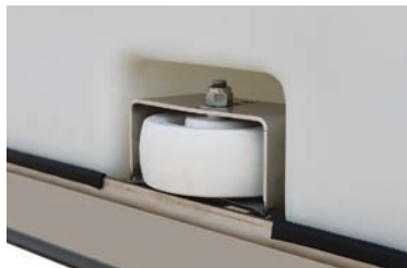
Integral guide wheels are standard