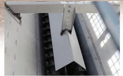
Inverted Vee on dual auger models