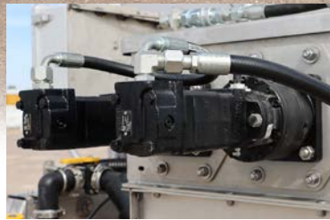
Conveyor options include pintle chain, double-bar pintle chain, belt-over-chain or dual augers