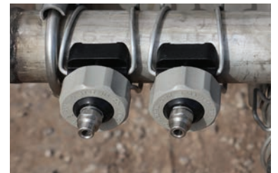
Easily replaceable spray nozzles are standard