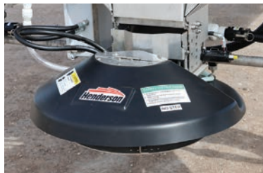
Standard spinner or optional Direct Cast spinner