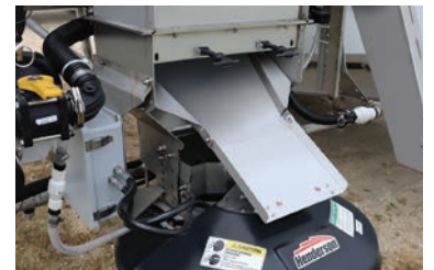
Spinner bypass chute is standard