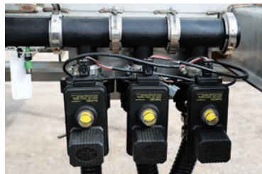
Electric ball valves for 1-, 2-, or 3-lane spray bar