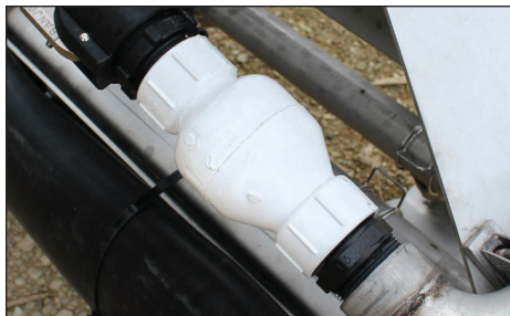
Standard adjustable check valve with a quick disconnect.