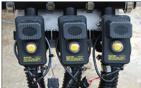
Standard trunnion style boom valves. Ball valves optional.