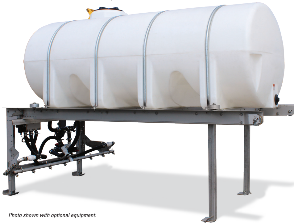
Photo shown with optional equipment.

Free standing horizontal bulk storage tanks are manufactured from UV stabilized, high-density polyethylene. 16" vented lid. Tanks are equipped with molded-in legs to support the tank, and band locators for tie-downs as well as baffling. Tank walls are translucent for level viewing and equipped with gallon indicators. Tank tie-down hoops are powder-coated mild steel. Stainless steel is optional.