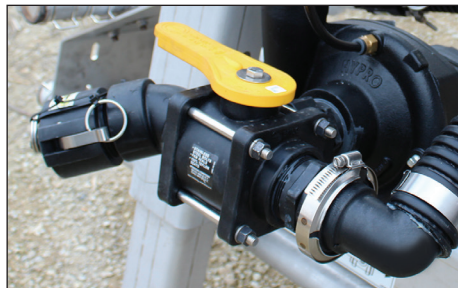
Standard valve for self-filling of unit.